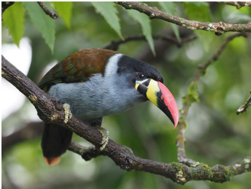
Gray-breasted Mountain-Toucan

Day 7: We shall explore the temperate forests of Atuen Valley for Gray-breasted Mountain-Toucan, Northern Mountain Cacique, Red-hooded Tanager, and Peruvian Treehunter (also known as Buff-throated or Rufous-backed Treehunter). There are good tanager flocks that are easy to see. Andean Condor is often seen in the area. The afternoon will be spent in the lovely gardens of Kenticafe looking for hummingbirds such as Purple-throated Sunangel, Rainbow Starfrontlet, and Sword-billed Hummingbird. Night in Leymebamba.