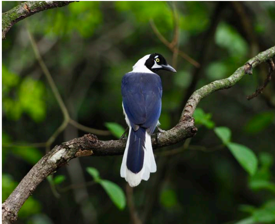
White-tailed Jay

We have lunch at Chaparri Lodge and in the afternoon bird the dry scrub for White-winged Guan, White-tailed Jay, Tumbes Tyrant, Collared Antshrike, and West Peruvian Screech-Owl in Chaparri. Night at Chaparri Lodge.