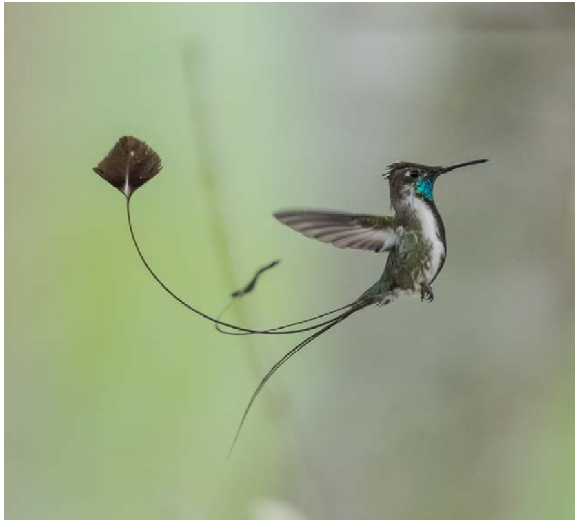
Marvelous Spatuletail

Day 9: Additional birding in the morning in Jaen looking for Little Inca-Finch and Shumba Antshrike -distinct subspecies of Collared Antshrike. The drive back to Pedro Ruiz with additional stops for Marañon Spinetail. Turning north to Pomacochas. We'll stop at Huembo to look for Marvelous Spatuletail and Little Woodstar, and a host of other hummingbird species. At night we shall look for Owls in the vicinity. Cinnamon Screech Owl, White-throated Screech-Owl, and Stygian Owl have been recorded here. Night at Huembo Lodge near Pomacochas.