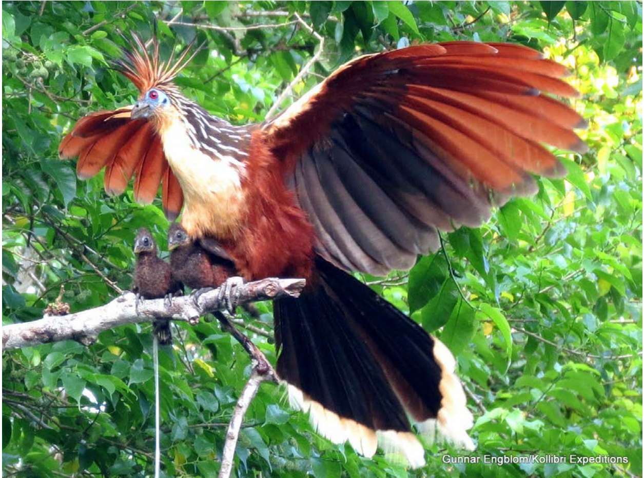
Hoatzin with chicks, photo by Gunnar Engblom