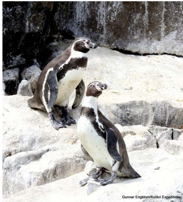
Humboldt Penguins

After lunch, we will take a boat trip around Pucusana Island. Birds that we should see include Humboldt Penguin, Guanay and Red-legged Cormorant, Inca Tern, Peruvian Seaside Cinclodes, Blackish Oystercatcher, Peruvian Pelican and Peruvian Booby. There is also a good number of South American Sea Lions