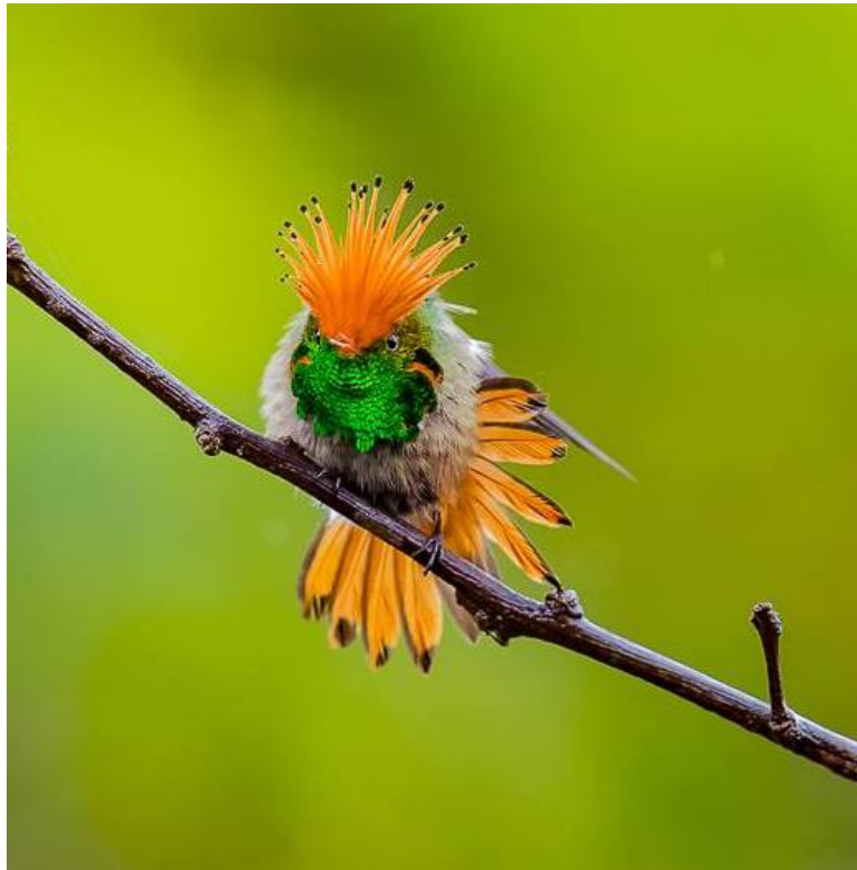
Rufous-crested Coquette

The area is good for Owls and Nightjars. Vermiculated Screech-Owl, Stygian Owl, Band-bellied Owl, Spectacled Owl, Subtropical Pygmy-Owl, Blackish Nightjar, Spot-tailed Nightjar, Rufous Nightjar and Little Nightjar.