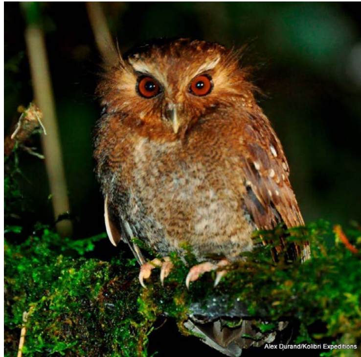
Long-whiskered Owlet

If it is a clear night we may also do an excursion to try for Long-whiskered Owlet this night to save ourselves from a longer walk at Owlet Lodge. Night at Huembo Lodge.